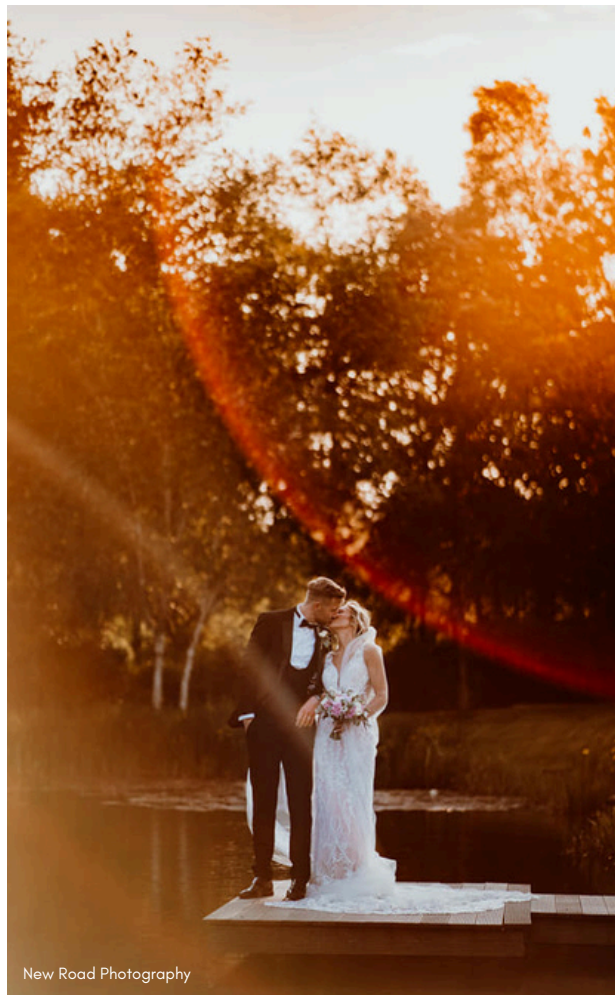
New Road Photography