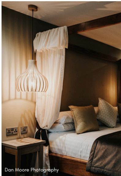
Dan Moore Photography