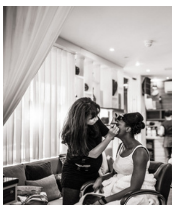
The Best Men Photography