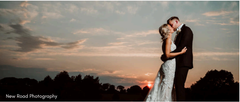
New Road Photography