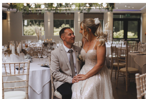
Iris & I photography