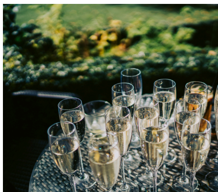
The Best Men Photography